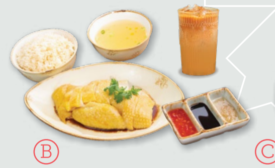
※ 招牌海南雞飯 Signature Hainan Chicken Rice $98