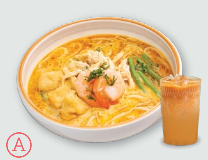
招牌大蝦雞絲喇沙 Auntie MALAY Prawns & Shredded Chicken Laksa $108