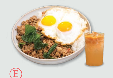
泰式肉碎煎蛋飯 Minced Pork & Fried Egg with Jasmine Rice ______ 可走辣 Non-spicy available $88