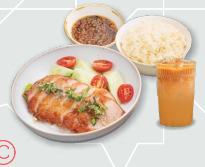
香茅燒豬頸肉 配 白飯 Grilled Lemongrass Pork Neck with Jasmine Rice $108