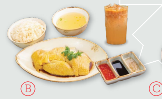
※ 招牌海南雞飯 Signature Hainan Chicken Rice $98