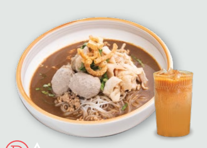
※ 泰式豬肉船麵 Thai Pork Boat Noodles 可走辣 Non-spicy available $108