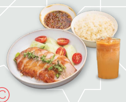
香茅燒豬頸肉 配 白飯 Grilled Lemongrass Pork Neck with Jasmine Rice $108