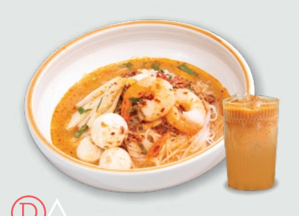
大蝦冬蔭湯金邊粉力 Tom Yum Phad Thai Noodles Soup with Prawns $108