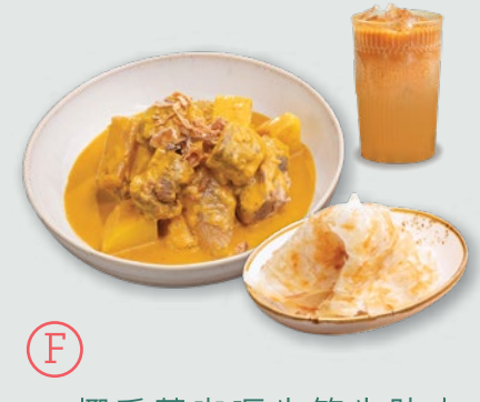
椰香黃咖喱牛筋牛肋肉 配 印度薄餅(1件) Yellow Curry Beef Short Rib & Tendon with Roti Paratha (1pc) $138