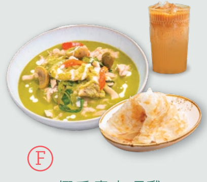
椰香青咖喱雞 配 印度薄餅(1件) 》 Creamy Chicken Green Curry with Roti Paratha (1pc) $118