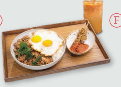
泰式肉碎煎蛋飯 Minced Pork & Fried Egg with Jasmine Rice ________ 可走辣 Non-spicy available