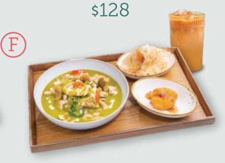
椰香青咖喱雞 配 印度薄餅(1件) 》

Creamy Chicken Green Curry with Roti Paratha (1pc)