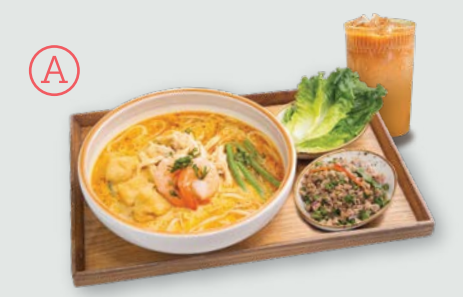
幾招牌大蝦雞絲喇沙♪ Auntie MALAY Seafood & Shredded Chicken Laksa