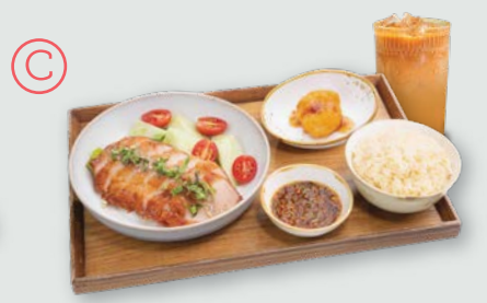
香茅燒豬頸肉 配 白飯 Grilled Lemongrass Pork Neck with Jasmine Rice