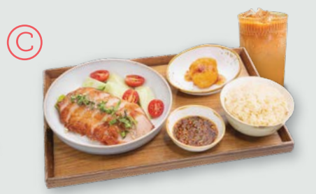
香茅燒豬頸肉 配 白飯 Grilled Lemongrass Pork Neck with Jasmine Rice