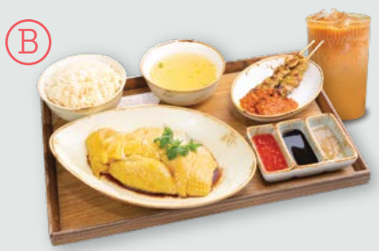
業招牌海南雞飯 Signature Hainan Chicken $128