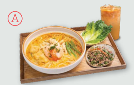
幾招牌大蝦雞絲喇沙♪ Auntie MALAY Prawns & Shredded Chicken Laksa