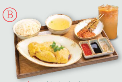
業招牌海南雞飯 Signature Hainan Chicken $128