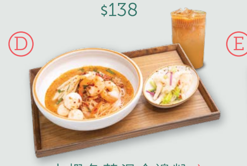
大蝦冬蔭湯金邊粉》 Tom Yum Phad Thai Noodles Soup with Prawns $138